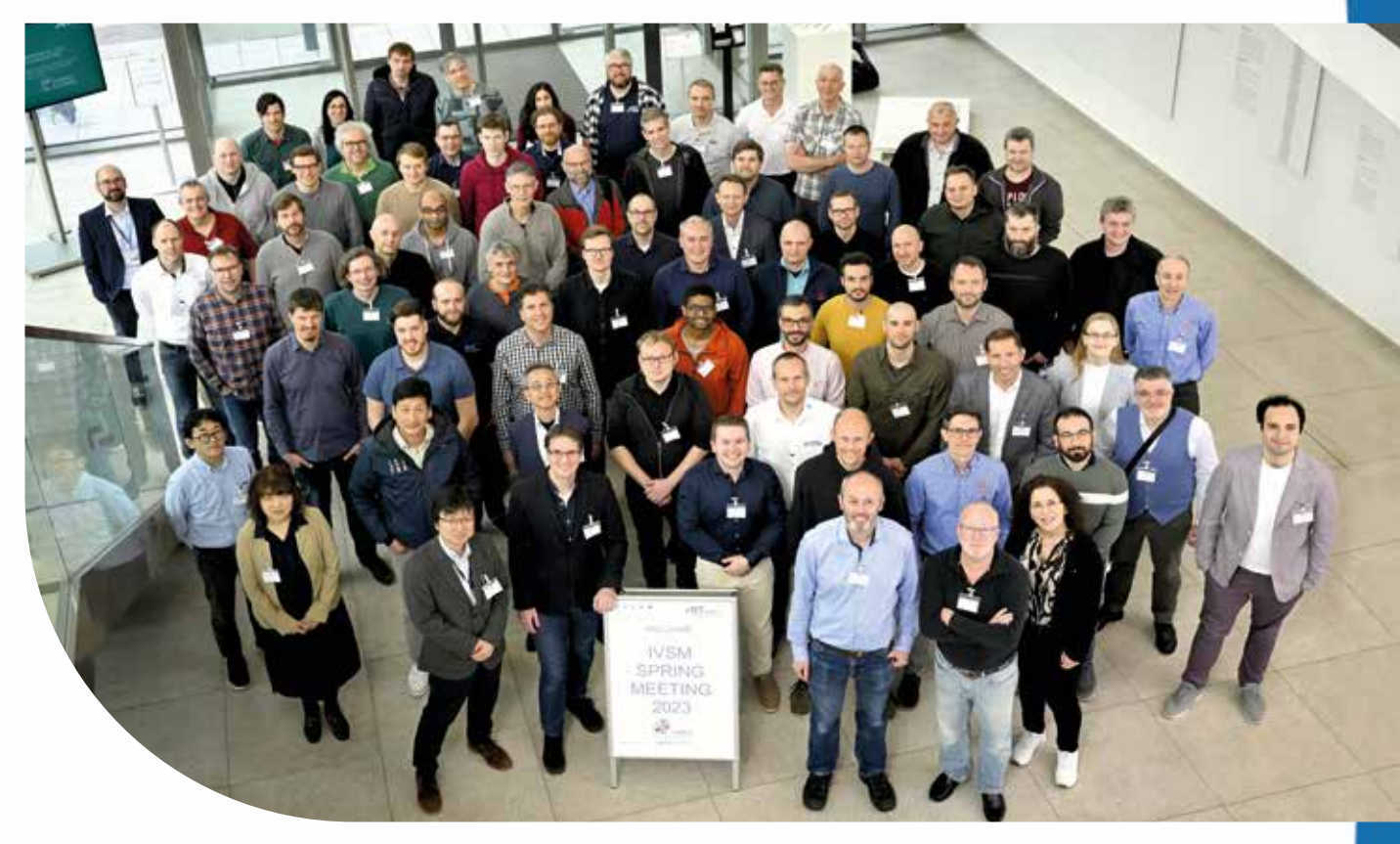
Vision Standards Meeting 2023